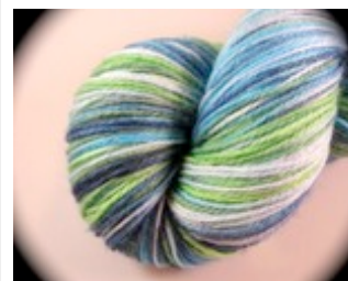
PARADISO - Back to ... yarnlust $20.00 USD