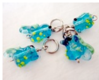
Seaside SEAHORSE S... yarnlust $4.00 USD