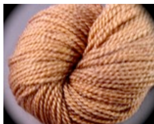
BRONZED - Sweet Sea... yarnlust $24.00 USD

This item sold out on 5.31.2009 Here are some more items from yarnlust