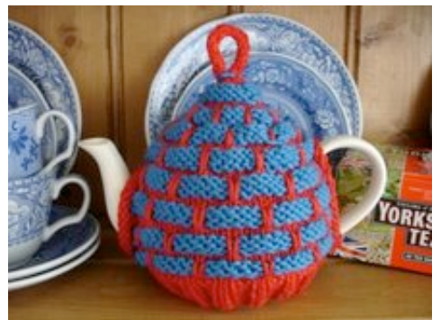
I love tea and tea cozies!