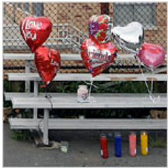
Applebome: Two Crimes So Dark