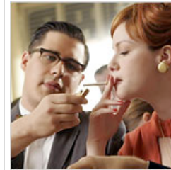
Basic Cable TV Is Having a Breakout Summer