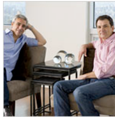
Two Designers, Amicably Split, and Still Sharing